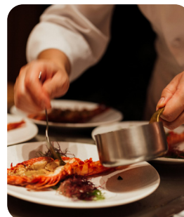
HALAL FOOD FESTIVAL & DEMONSTRATION